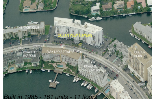
Built in 1985 - 161 units - 11 floors