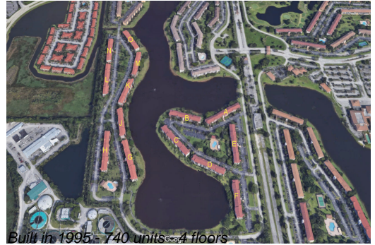
Built in 1995 - 740 units - 4 floors