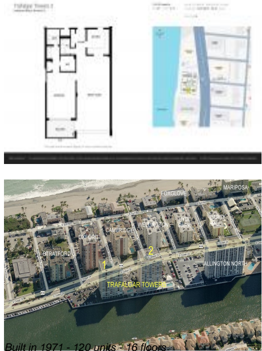
Built in 1971 - 120 units - 16 floors