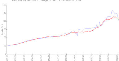
Garfield at Century Village (A-D) vs Pembroke Pines