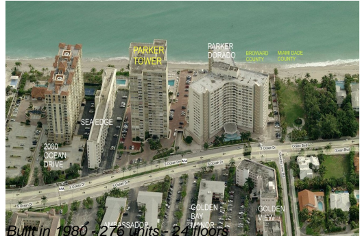
Built in 1980 - 276 units - 24 floors