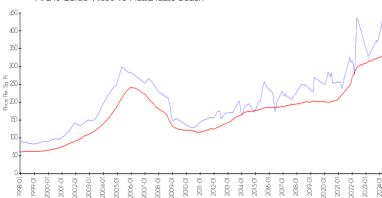
Avant Garde West vs Hallandale Beach