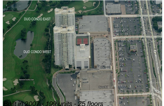
Built in 2007 - 199 units - 25 floors