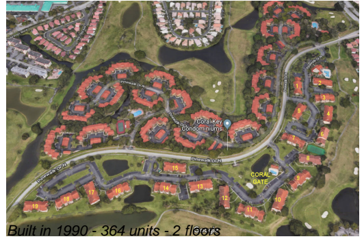
Built in 1990 - 364 units - 2 floors

The above valuated price is a baseline figure that does not take into account any specific renovation, upgrade, split, merge, or deterioration of the unit.