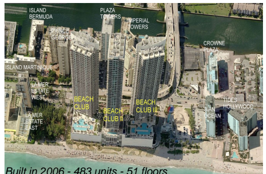
Built in 2006 - 483 units - 51 floors