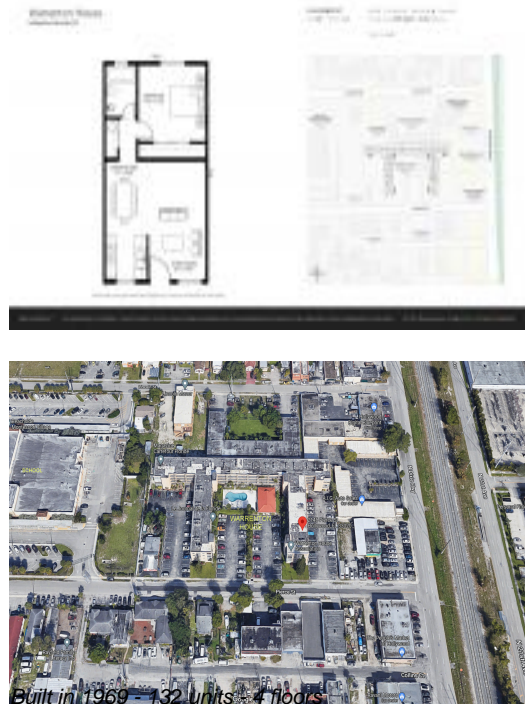
Built in 1969 - 132 Units - 4 Floors