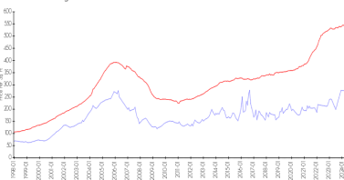
Coral Ridge Towers (West) vs Fort Lauderdale