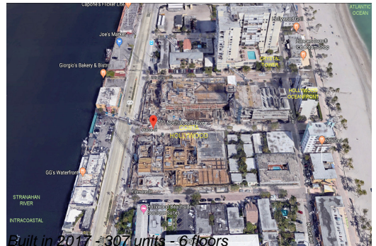
Built in 2017 - 307 units - 6 floors