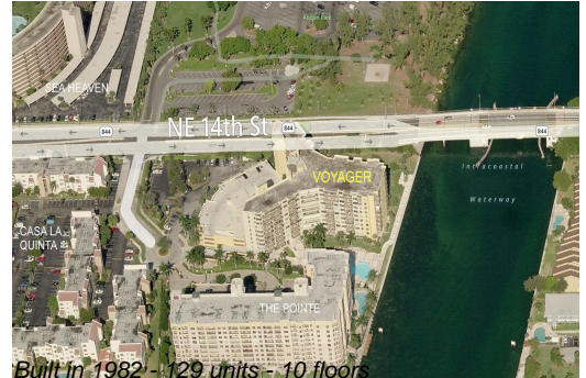
Built in 1982 - 129 units - 10 floors