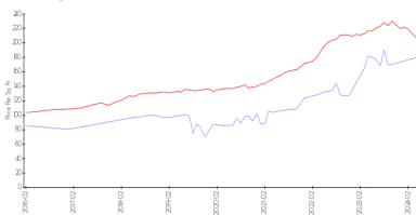
Pembroke Pines vs Broward