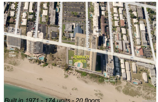
Built in 1971 - 174 units - 20 floors