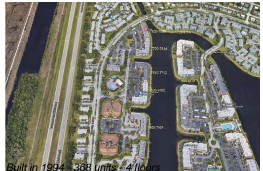
Built in 1994 - 368 units - 4 floors