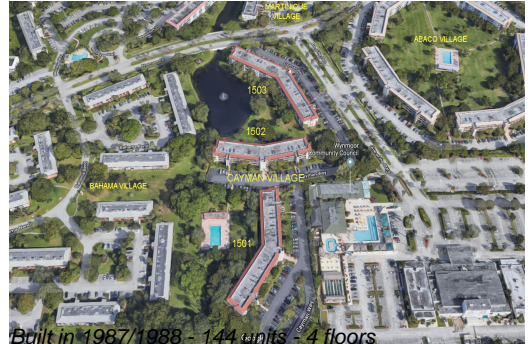
Built in 1987/1988 - 144 units - 4 floors