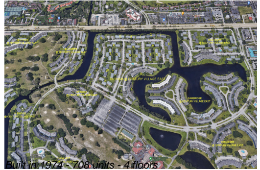
Built in 1974 - 708 units - 4 floors