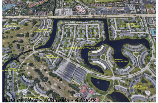
Built in 1974 - 708 units - 4 floors