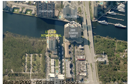
Built in 2002 - 65 units - 15 floors