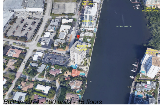
Built in 1974 - 100 units - 16 floors