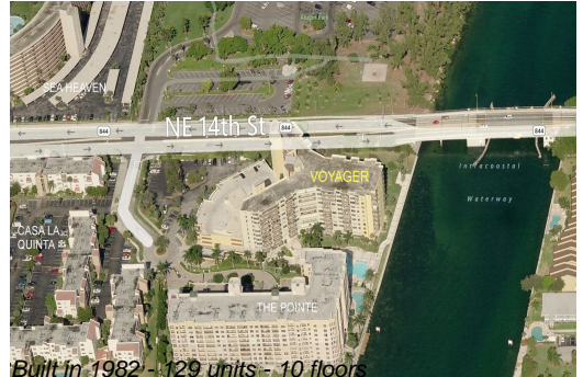
Built in 1982 - 129 units - 10 floors