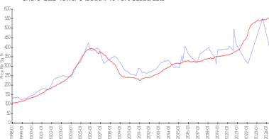
Shore Club Tower 1 (South) vs Fort Lauderdale