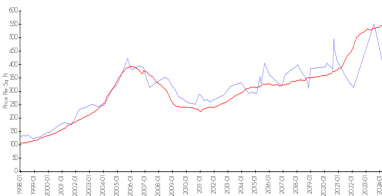
Shore Club Tower 1 (South) vs Fort Lauderdale