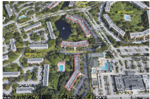
Built in 1987/1988 - 144 units - 4 floors