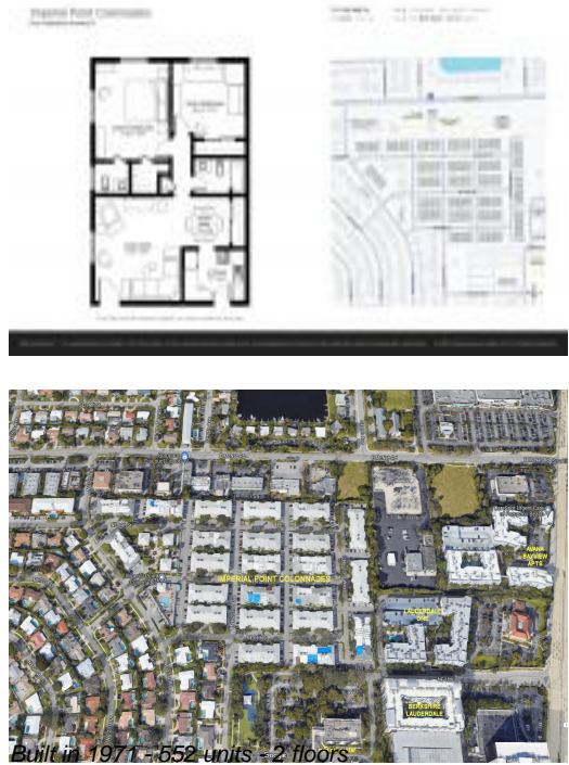
Built in 1971 - 552 units - 2 floors