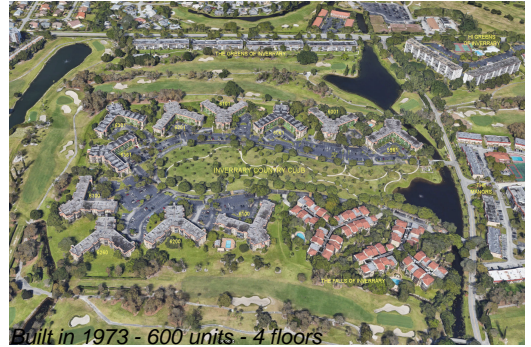
Built in 1973 - 600 units - 4 floors