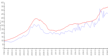
Commodore vs Fort Lauderdale