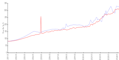
El Ad Residences at Miramar vs Miramar