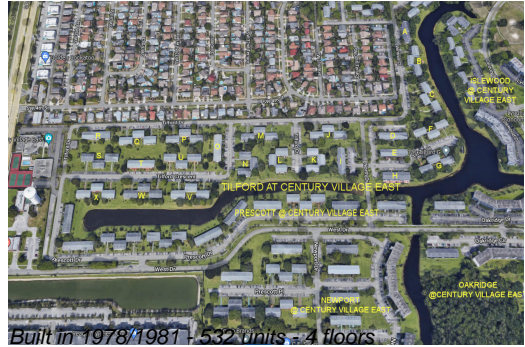
Built in 1978/1981 - 532 units - 4 floors