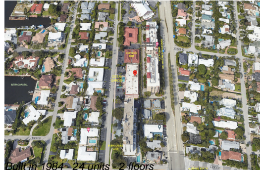
Built in 1984 - 24 units - 2 floors