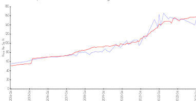
Coventry at Oakleaf Plantation vs Orange Park