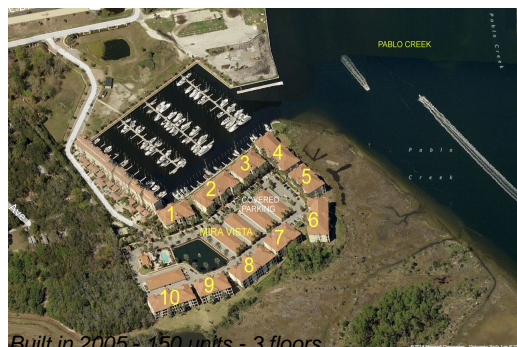
Built in 2005 - 150 units - 3 floors