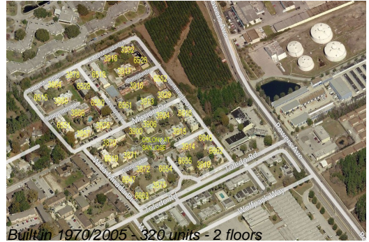
Built in 1970/2005 - 320 units - 2 floors

Number of units: 320 Number of active listings for rent: 0 Number of active listings for sale: 6 Building inventory for sale: 1% Number of sales over the last 12 months: 19 Number of sales over the last 6 months: 8 Number of sales over the last 3 months: 3