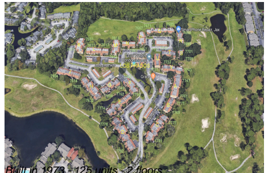
Built in 1973 - 125 units - 2 floors