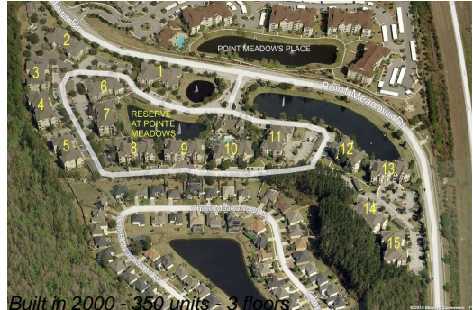
Built in 2000 - 350 units - 3 floors