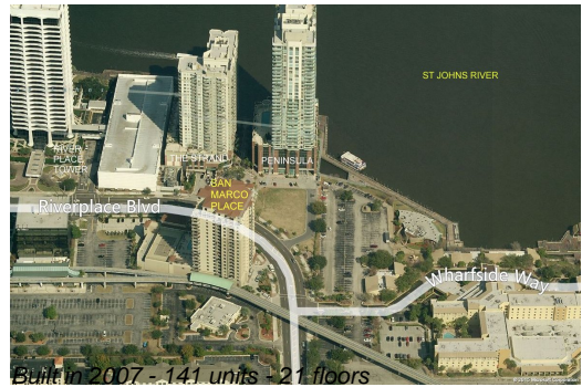
Built in 2007 - 141 units - 21 floors