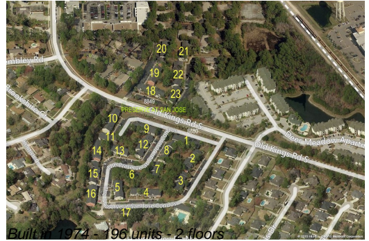
Building 1974 - 196 units - 2 floors