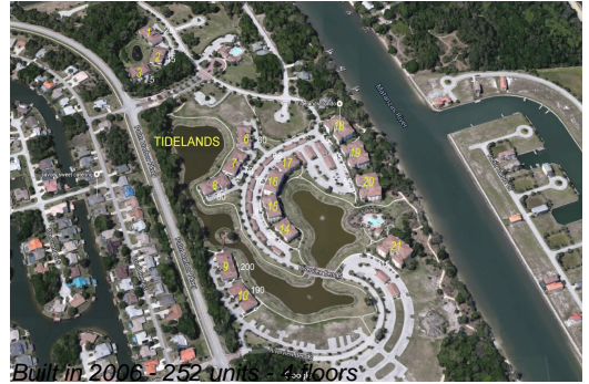
Built in 2006 - 252 units - 4 floors