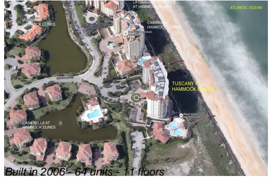
Built in 2006 - 64 units - 11 floors