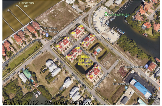
Built in 2012 - 25 units - 2 floors