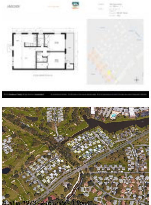
Built in 1973 - 216 units - 1 floor