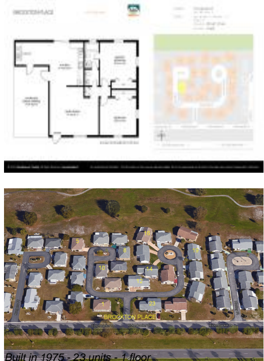
Built in 1975 - 23 units - 1 floor