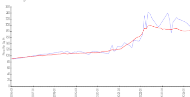
Eagle Palm II vs Riverview

Eagle Palm II: $193/sq. ft. Riverview: $183/sq. ft.