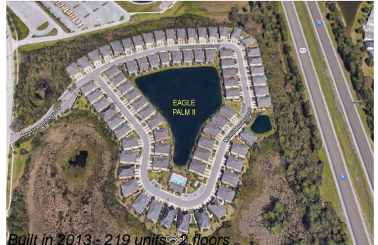
Built in 2013 - 219 units, 2 floors