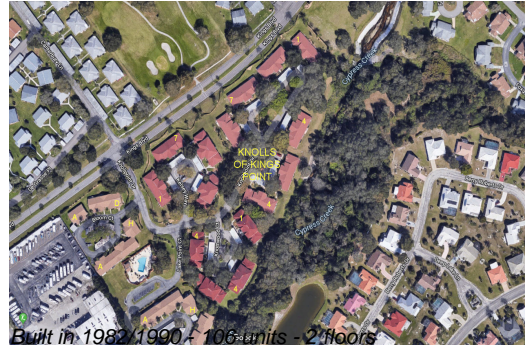
Built in 1987/1990 / 106 units - 2 floors