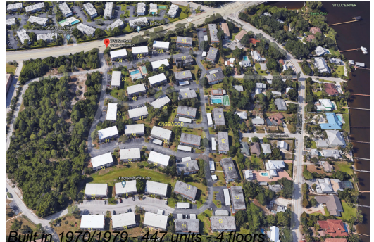
Built in 1970/1979 - 447 units - 4 floors