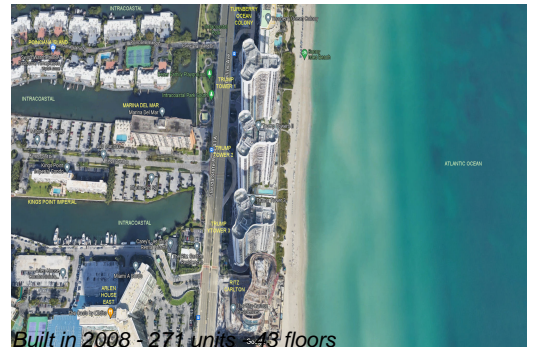
Built in 2008 - 271 units - 43 floors