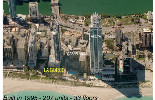
Built in 1995 - 207 units - 33 floors