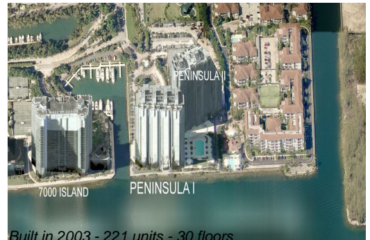
Built in 2003 - 221 units - 30 floors