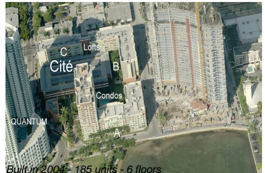
Built in 2004 - 185 units - 6 floors