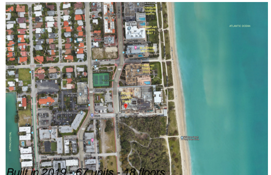
Built in 2019 - 67 units - 18 floors